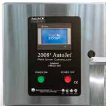
AutoJet 2008+ Spray Control Panel

It's easier than ever to experience the benefits of Precision Spray Control (PSC) in your operations. This AutoJet Spray System offers unmatched spray performance and operating flexibility and is easy to set up and simple to use. The system includes: a spray controller, a zone control panel, a spray manifold with electrically-actuated spray nozzles and a liquid delivery module. It's pre-engineered, pre-tested and readily available for quick delivery.