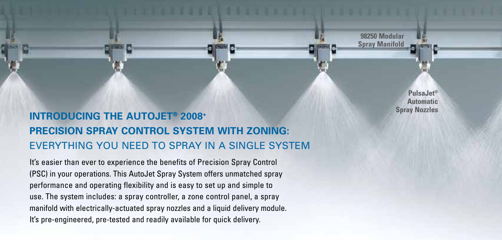
98250 Modular Spray Manifold